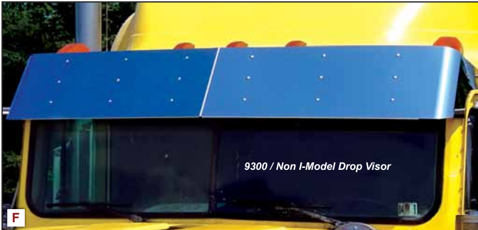
9300 / Non I-Model Drop Visor

F. 9300 / NON I-MODEL DROP VISORS Replaces factory fiberglass or stainless visor. Fits trucks with wipers on the bottom of windshield. [1989-1999] (Sold as a kit)