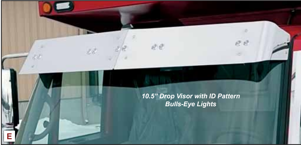
10.5" Drop Visor with ID Pattern Bulls-Eye Lights