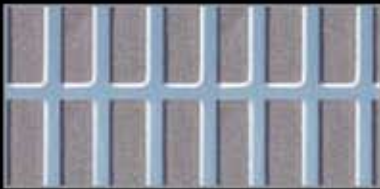
-31 Vertical Rectangles