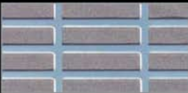
-30 Horizontal Rectangles