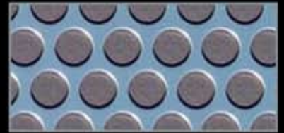
-24 Large 7/16" Circles