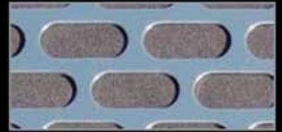
-40 Horizontal 5/16" Obrounds