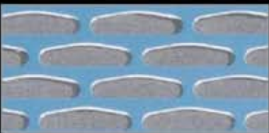
-21 Freightliner Logos