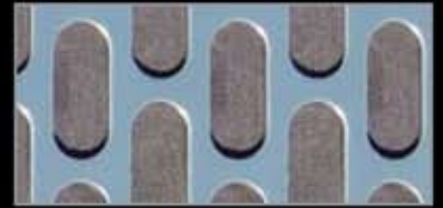
-41 Vertical 5/16" Obrounds