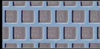
-33 9/32" Offset Squares