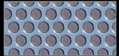
-23 Small 1/4" Circles