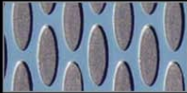
-37 Vertical Ovals