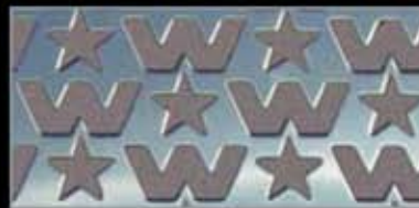
-46 W & Star