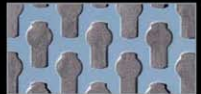
-20 Kenworth Keyholes

Add the above punch number to the end of any punch part to receive the desired punch option for your truck. EX: 35399-36 is a Peterbilt Grill with Horizontal Oval Punches.