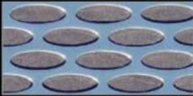
-36 Horizontal Ovals

Punches are Shown at 75% of their Actual Size.