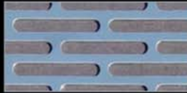
-38 Horizontal 3/16" Obrounds