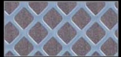
-47 Snake Skin