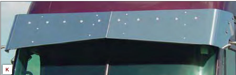
See Image E Previous Page for 3 Bolt Visor Example.