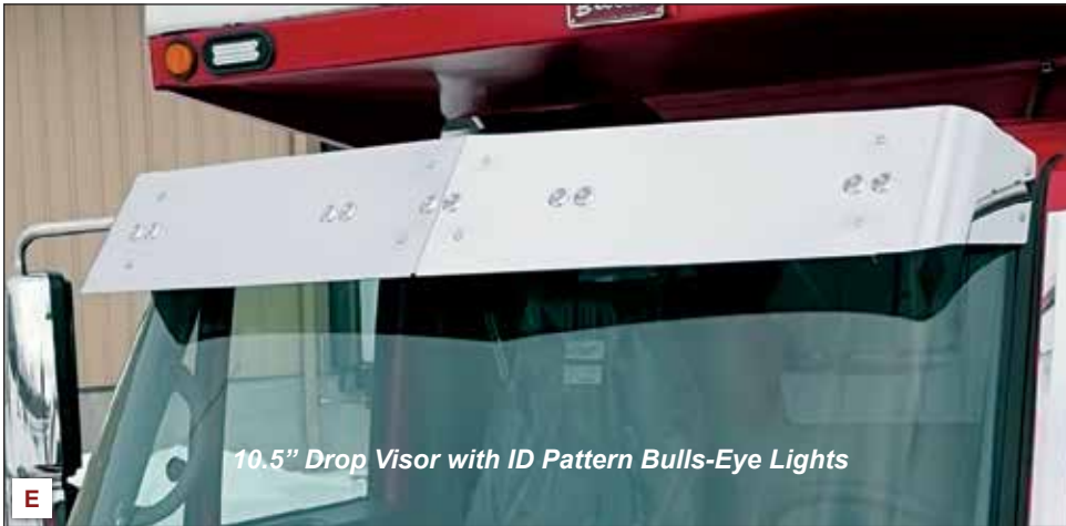
10.5" Drop Visor with ID Pattern Bulls-Eye Lights