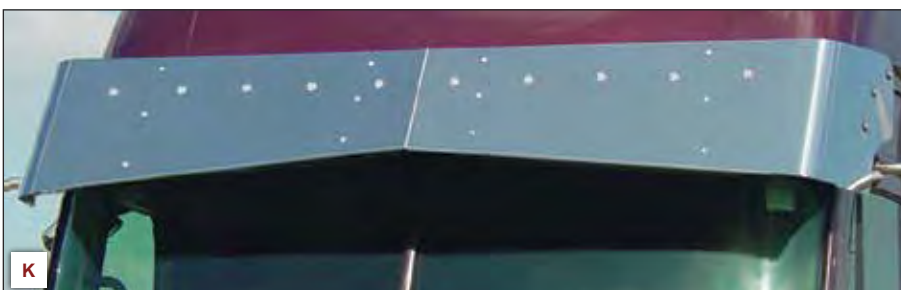
See Image E Previous Page for 3 Bolt Visor Example.