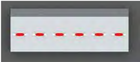
19 - (6) M5 Lights with Bezels