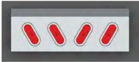
17 - (4) Oval Lights with Bezels, \ \ //