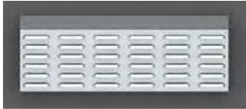
2 - Louvered