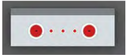
6 - (3) Bulls-Eye Lights / (2) 4" Rnd Lights with Bezels