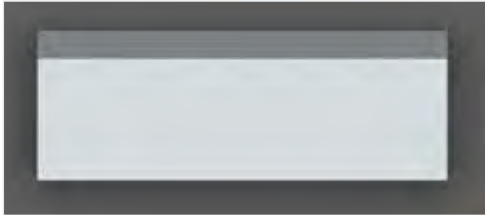
1 - Blank

Go to pages 348 - 356 in the Universal Section to see our lights.