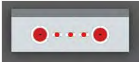
8 - (3) M3 Lights / (2) 4" Rnd Lights with Bezels