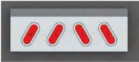
16 - (4) Oval Lights with Bezels, // \