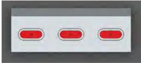
14 - (3) Oval Lights with Bezels