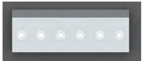
12 - (6) Fusion Lights with Bezels