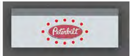
24 - (12) Bulls-Eye Lights and Logo Holes