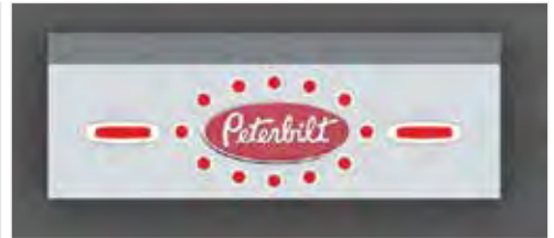
21 - (12) Bulls-Eye with (2) Crew Lights and Logo Holes