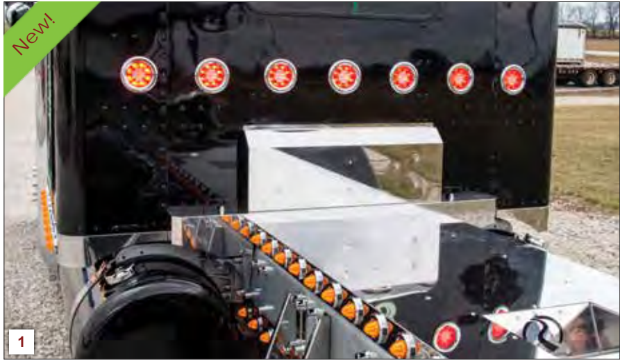
2 Piece Kit - Upper piece conceals shocks, lower piece conceals air bags. Peterbilt Shock / Air Bag Covers use two factory bolts plus five additional screws to mount on back of sleeper. Logo not included. Logos are only available from an authorized dealer.

Call RoadWorks Customer Service at 1-800-448-8741 for information on Shock/Air Bag Covers with the new Mini Light.