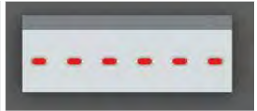
18 - (6) Challenger Lights with Bezels