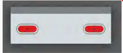
15 - (2) Oval Lights with Bezels