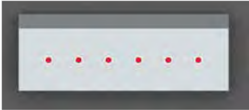
13 - (6) Bulls-Eye Lights with Bezels

Go to pages 348 - 356 in the Universal Section to see our lights.