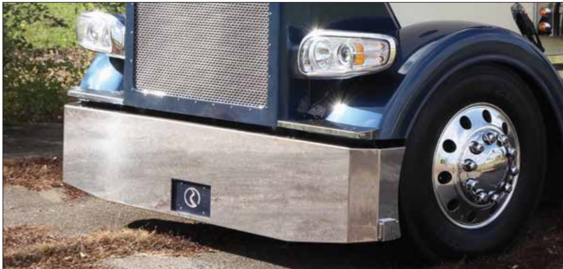
Custom Blind Mount Blank Face Bumper with Side Radiuses, Mitered Ends, Recessed License Plate Holder, and Side Signal Lights.