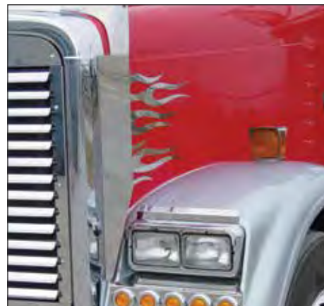
LOUVERED SIDE VIEW