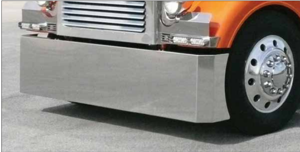
Custom Blind Mount Blank Face Bumper with Side Radiuses, and Mitered Ends.