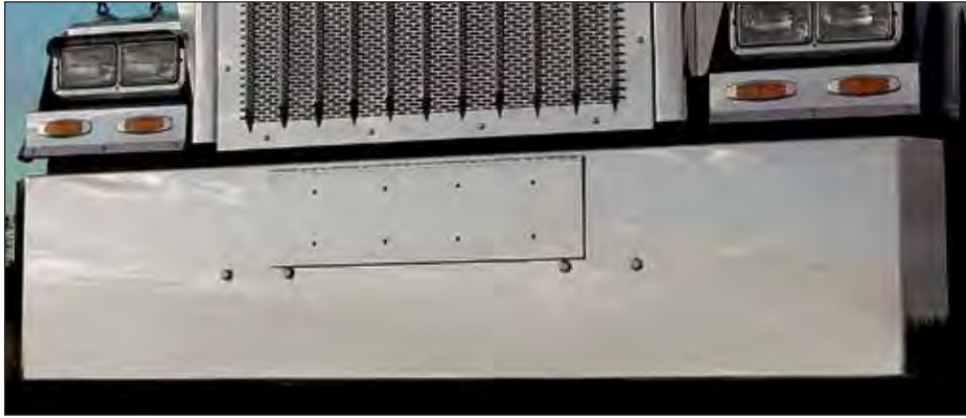
Standard Mount Blank Face Bumper with Mitered Ends, and Hinged Plate Hanger.