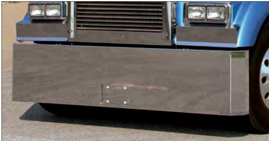
Custom Blind Mount Blank Face Bumper with Recessed License Plate Holder, and Mitered Ends.