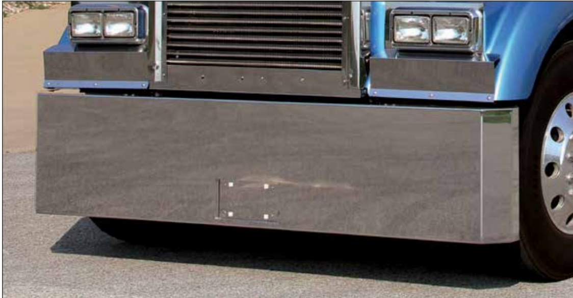
Custom Blind Mount Blank Face Bumper with Recessed License Plate Holder, and Mitered Ends.