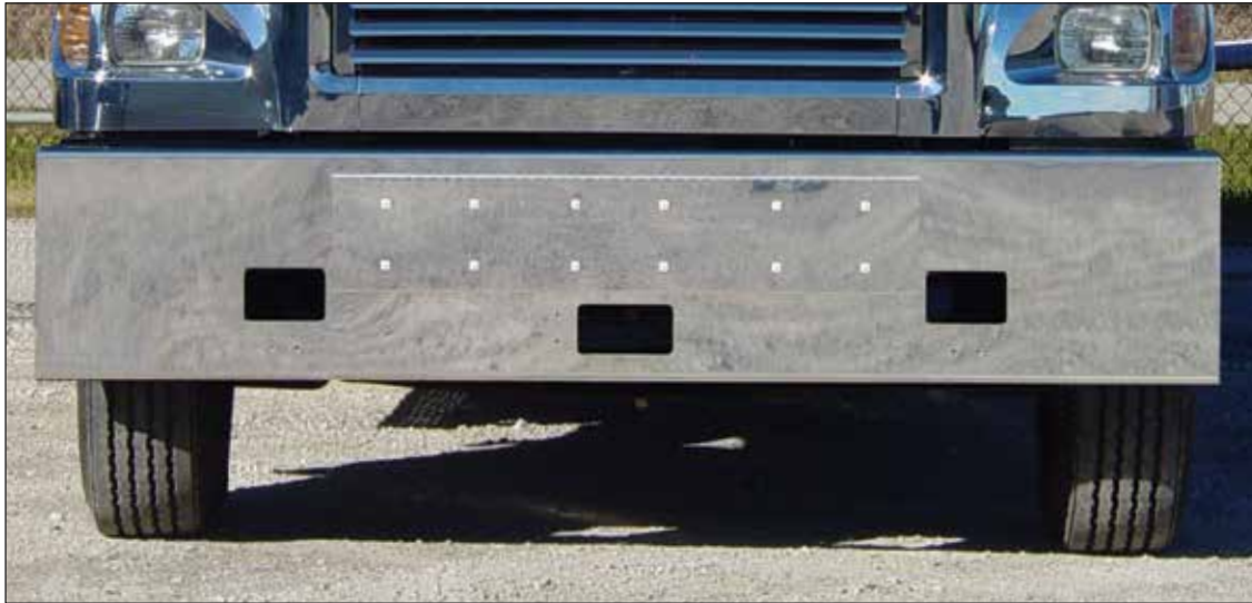
Custom Blind Mount Bumper with Tow Holes, Box Ends, and Hinged Plate Holder.