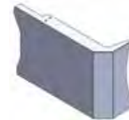
MITERED END WITH SIDE RADIUS