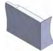
BOX END WITH SIDE RADIUS

Tapered Bottoms Side Radius cut to match tire profile Recessed Plate Holder Custom Cut Lettering Bumper Back Lighting Custom Cut Holes