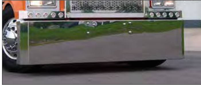
Standard Mount Blank Face Bumper with Mitered Corners.

Discuss your ideas with your favorite chrome dealer or with Roadworks Customer Service at: 1-800-448-8741.