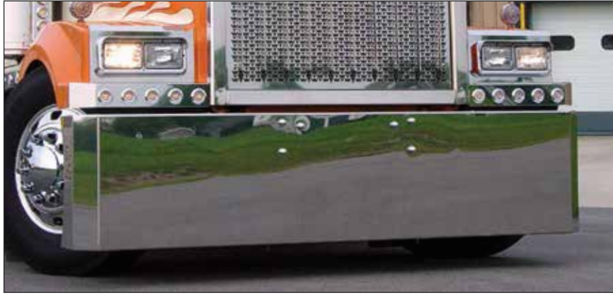
Standard Mount Blank Face Bumper with Mitered Corners.

MULTI-FIT BLIND MOUNT BUMPERS Fits Western Star Constellation and Low Max [2007 & Newer] (Each)