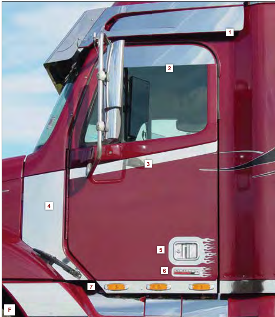
See page 37 for Century/Columbia Sleeper Panels.