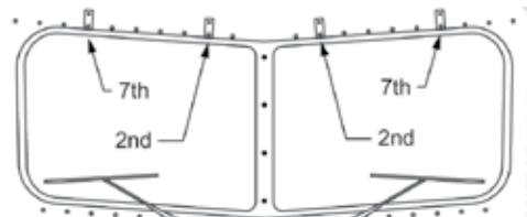
[1973 & Newer] 359 Factory Bracket Locations