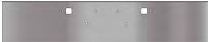
STANDARD MOUNT / WITH TOW HOLE