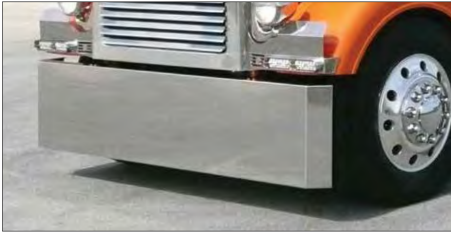
Blind Mount with Mitered Ends.