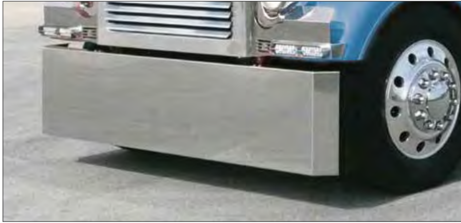
379 Blind Mount Bumper with Mitered Ends