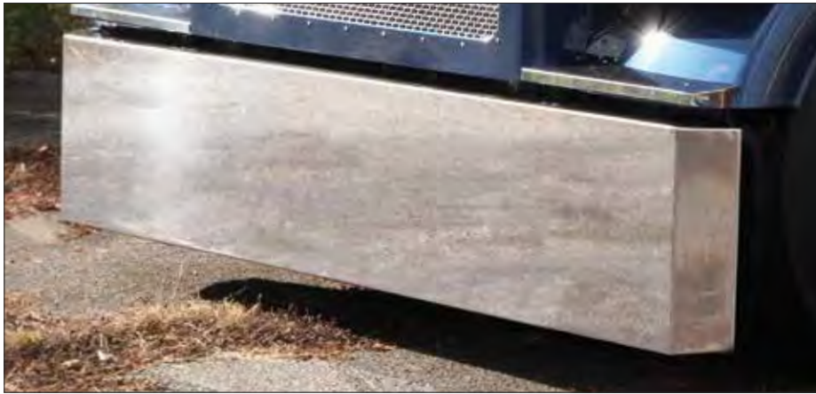
388 / 389 Blind Mount Bumper with Mitered Ends