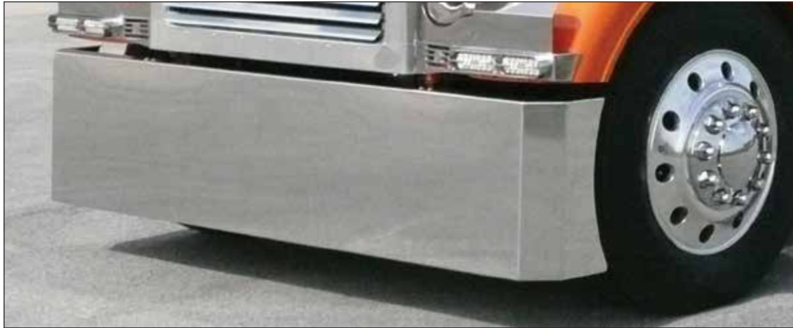
Custom Blind Mount Blank Face Bumper with Side Radiuses, and Mitered Ends.