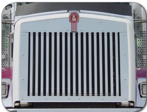
45300 KW T800 Replacement Grill with 17 Vertical Bars, 1995 & Newer

Thank you for choosing RoadWorks stainless steel accessories!